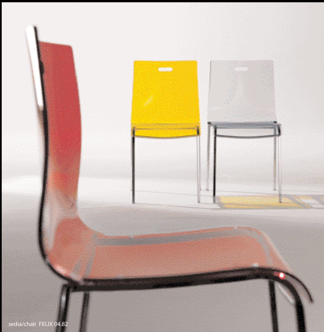
sedia/chair FELIX 04.82