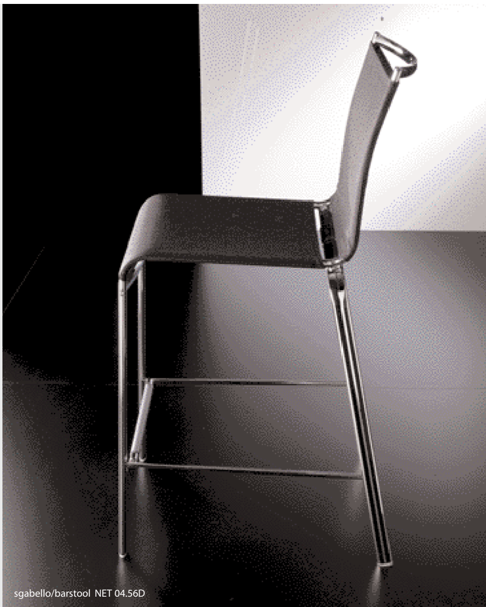
sgabello/barstool NET 04.56D